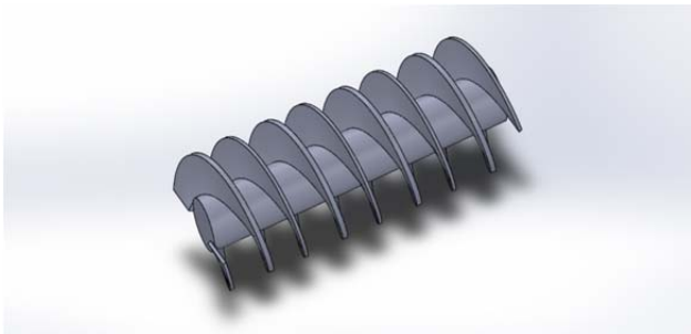
Fig. 2: CAD Model of the Screw